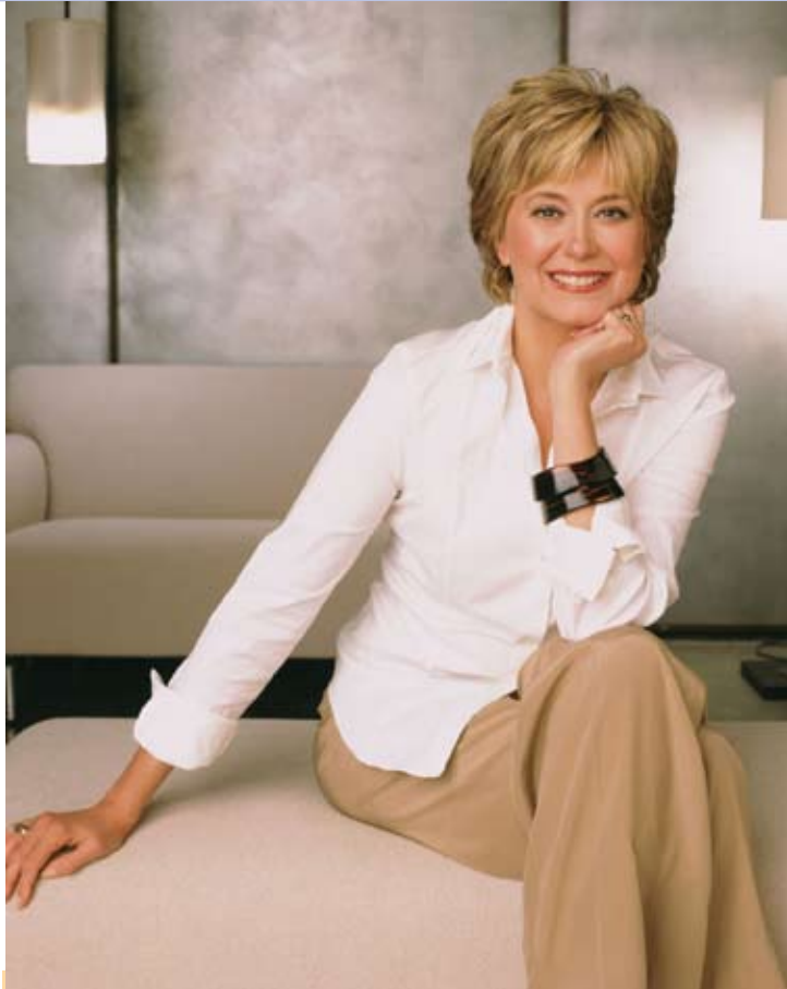
Jane Pauley is the keynote speaker at the "Women of Influence" Breakfast at the Four Points by Sheraton in Greensburg, PA. Eden Hall Foundation is the Premier Sponsor of this Women's Leadership Council event.